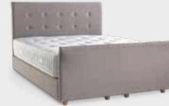
Andalucia Low Bed Frame with Footboard