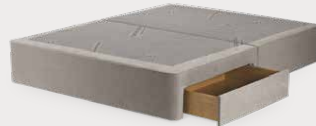
2 Standard Drawers