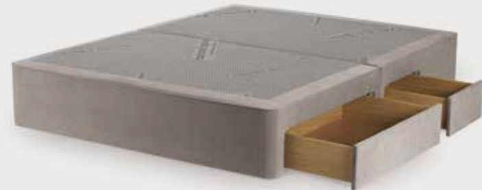
2 Continental and 2 Standard Drawers