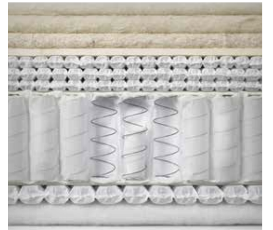
Cross-section of the Santiago