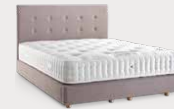
Andalucia Low Bed Frame