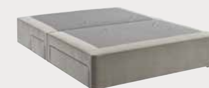
REINFORCED PLATFORM TOP BASE (with inset castors)

Benefiting from our exclusive True Edge design, this slim divan base features 2500 springs, providing deeper comfort and improving the performance and lifetime of the mattress. The base and complementary headboard can be upholstered in any of the Harrison fabrics. By special request this base is also available as a Reinforced Platform Top Base.