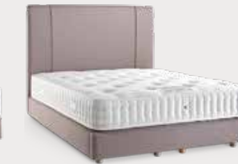
Deco Low Bed Frame