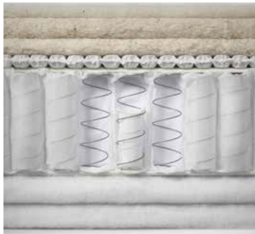
Cross-section of the Havana