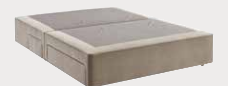
2500 TRUE EDGE DEEP DIVAN (with inset castors)

Providing a sturdy foundation for your Turn Free mattress, the Reinforced Platform Top Base offers a smart alternative to bed legs. The base can be upholstered to match your headboard and customised with a variety of storage options.