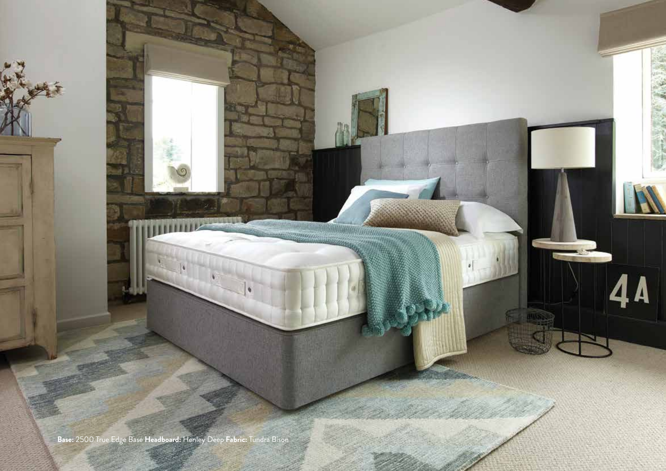
Base: 2500 True Edge Base Headboard: Henley Deep Fabric: Tundra Bison