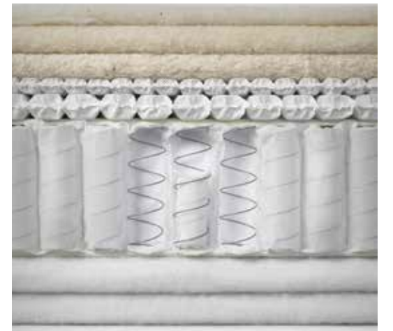
Cross-section of the Lima