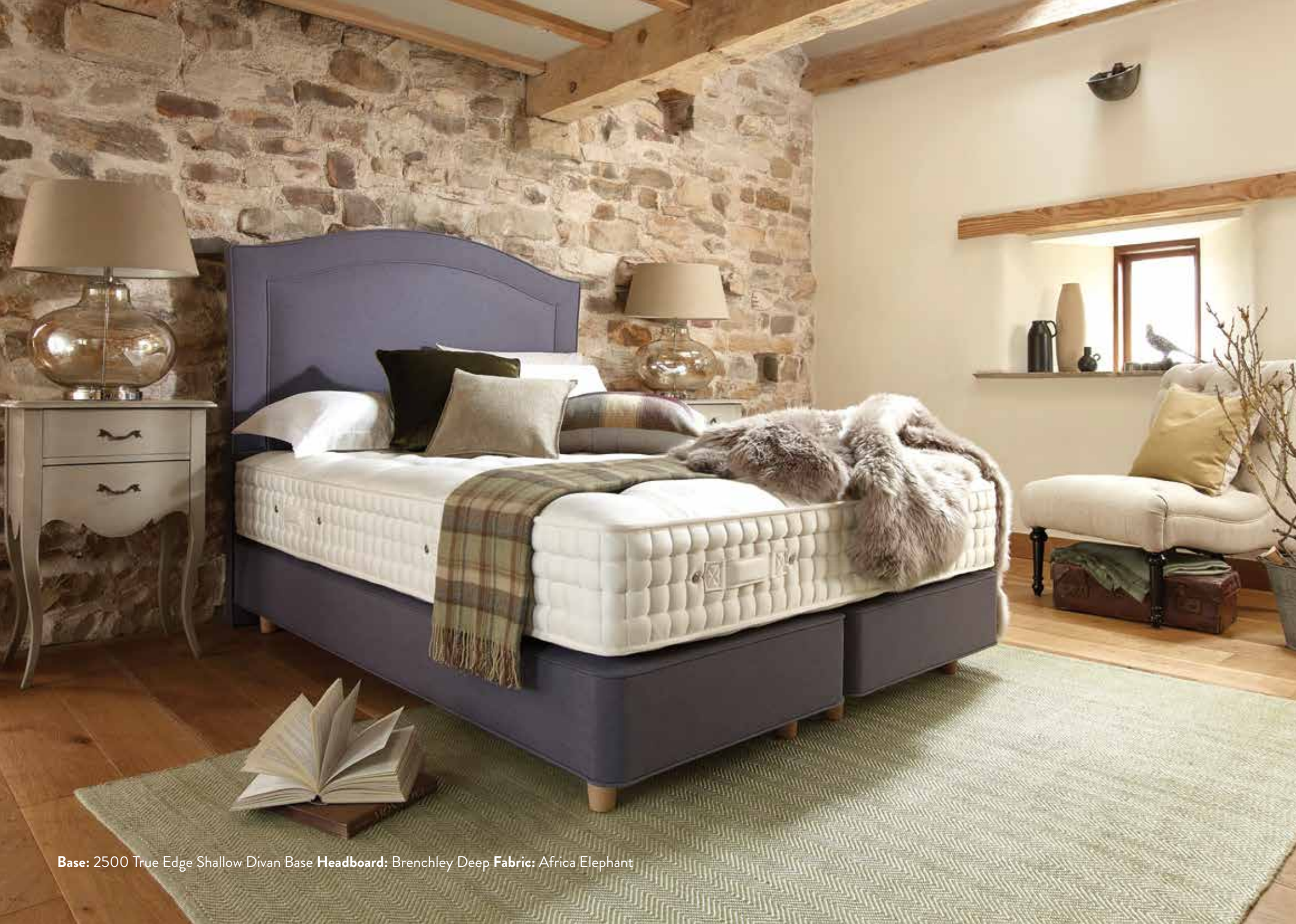
Base: 2500 True Edge Shallow Divan Base Headboard: Brenchley Deep Fabric: Africa Elephant