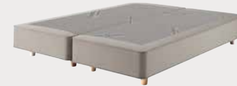
2500 TRUE EDGE SHALLOW DIVAN (with legs)

All mattresses in the Free and Easy Elite Collection now have the option of being partnered with a Deep or Shallow base in either 2500 True Edge or Platform Top.