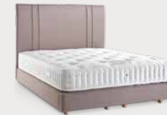
Mackintosh Low Bed Frame