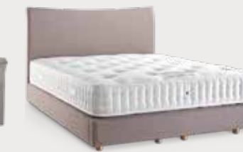
Orient Low Bed Frame