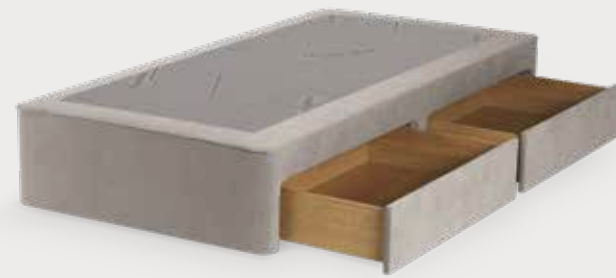
2 Standard Drawers (Single)

Storage is not available on shallow divan bases or bed frames.