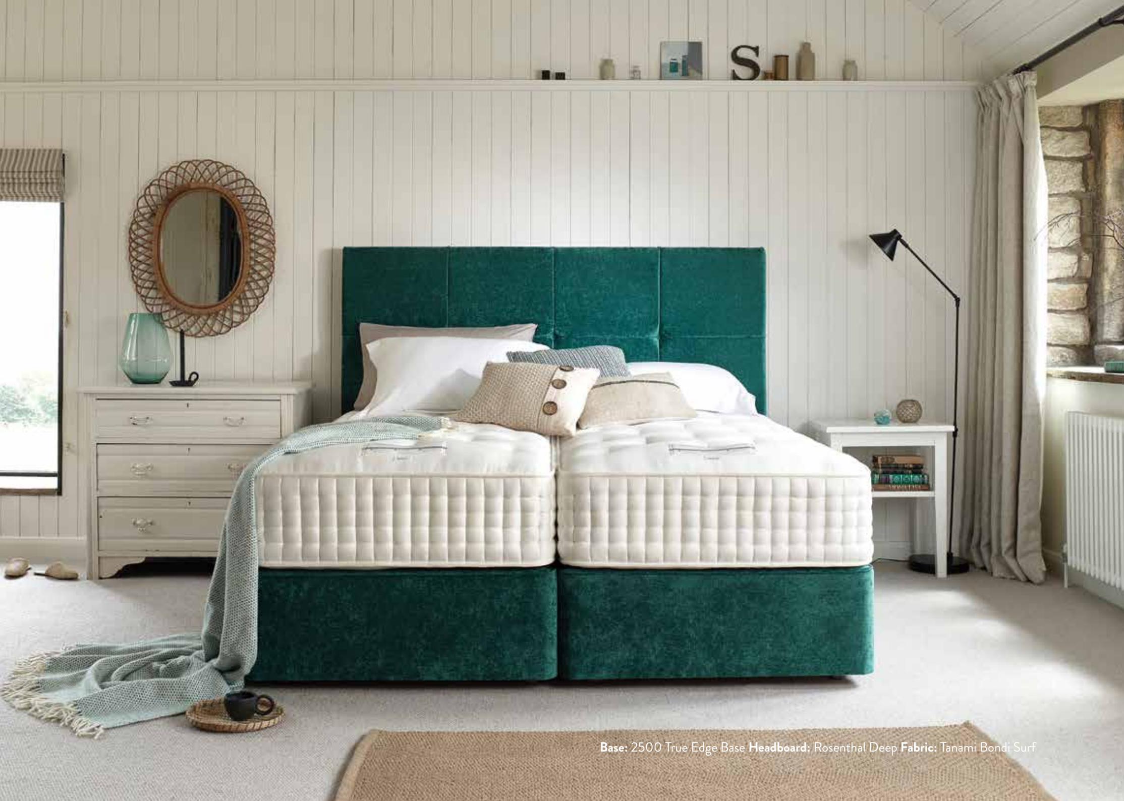
Base: 2500 True Edge Base Headboard: Rosenthal Deep Fabric: Tanami Bondi Surf