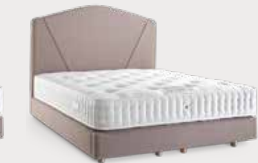
Nouveau Low Bed Frame