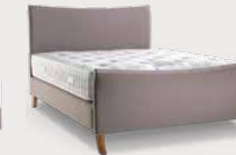
Orient Low Bed Frame with Footboard