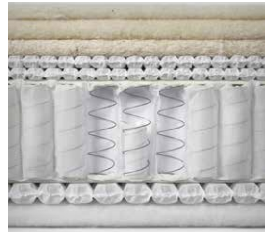
Cross-section of the Rosario