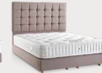
Liberty Low Bed Frame