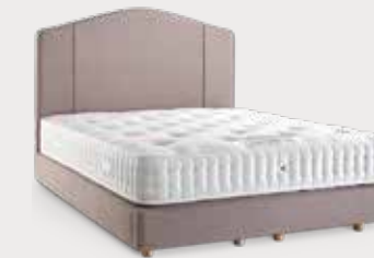
Tiffany Low Bed Frame

The contemporary alternative to a divan. There are seven low bed frames to choose from and two bed frames with footboards. Each is upholstered with your choice of our luxurious fabrics and you can choose the colour of the legs too. As always, we don't compromise on comfort, which is why each bed frame features a full True Edge pocket sprung base.