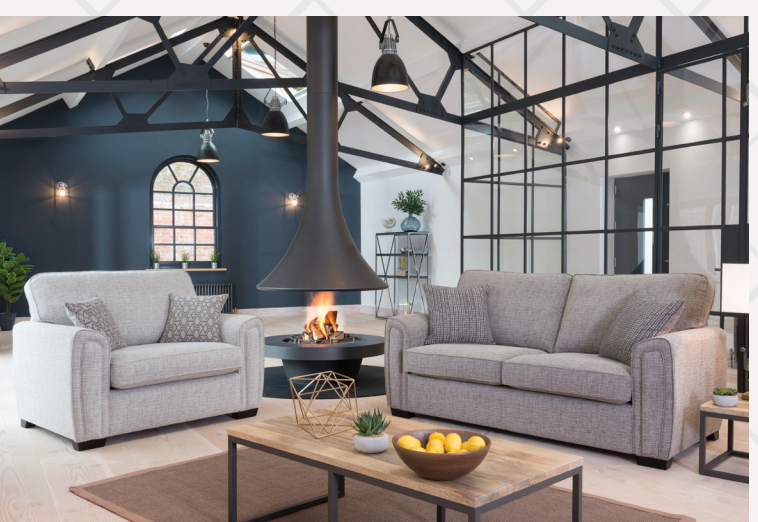
dark feet. Snuggler in fabric 7836, small scatter cushions in 7005/7836, dark feet.