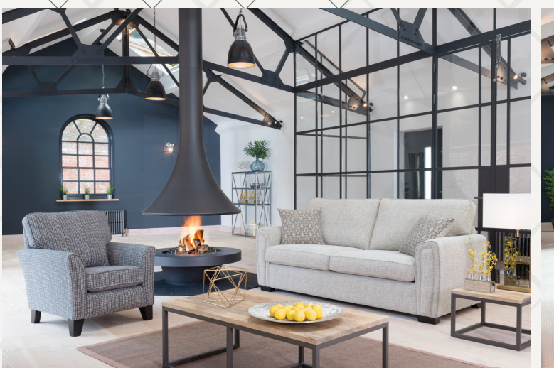
Grand sofa (standard back) in fabric 7836, large scatter cushions in 7005/7836, dark feet. 3 seater sofa/sofabed (standard back) in fabric 7837, large scatter cushions in 7015/7837, Accent chair in fabric 7015, dark legs.