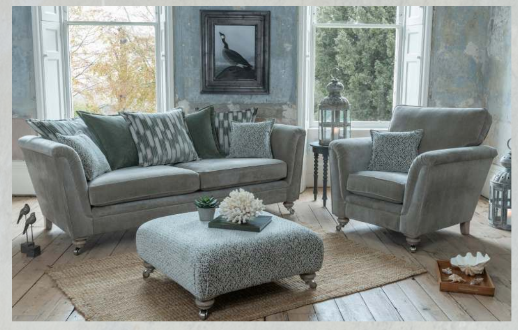
Grand sofa (pillow back) in fabric 5617, 3 pillows in 5220, 2 pillows in 5610, small scatter cushions in 5440, grey ash/satin nickel castor legs. Chair in fabric 5617, small scatter cushion in 5440, grey ash/satin nickel castor legs. Square stool in fabric 5440, grey ash/satin nickel castor legs.