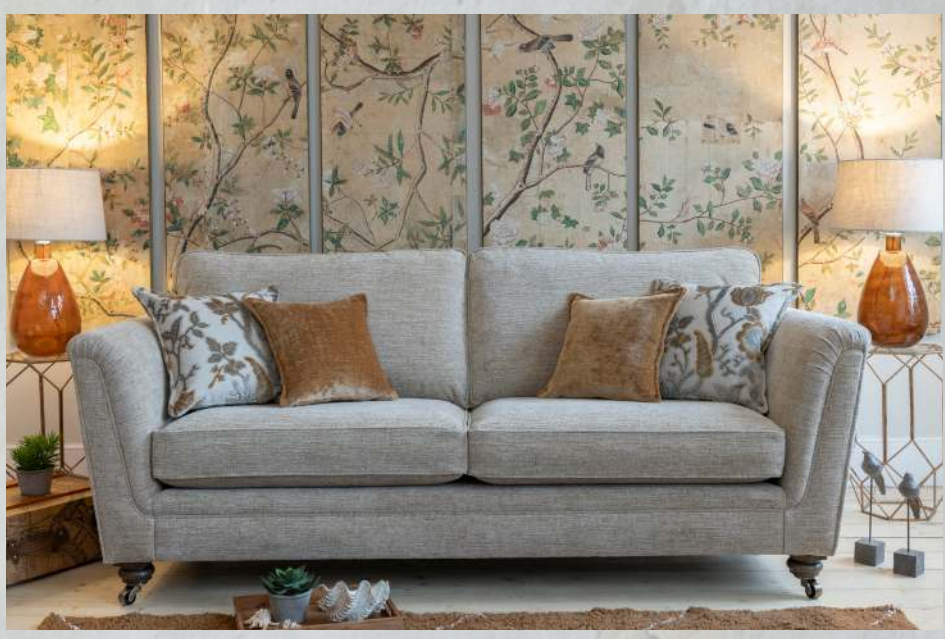
Grand sofa (standard back) in fabric 5718, large scatter cushions in 5118, small scatter cushions in 5593, antique ash/antique brass castor legs.