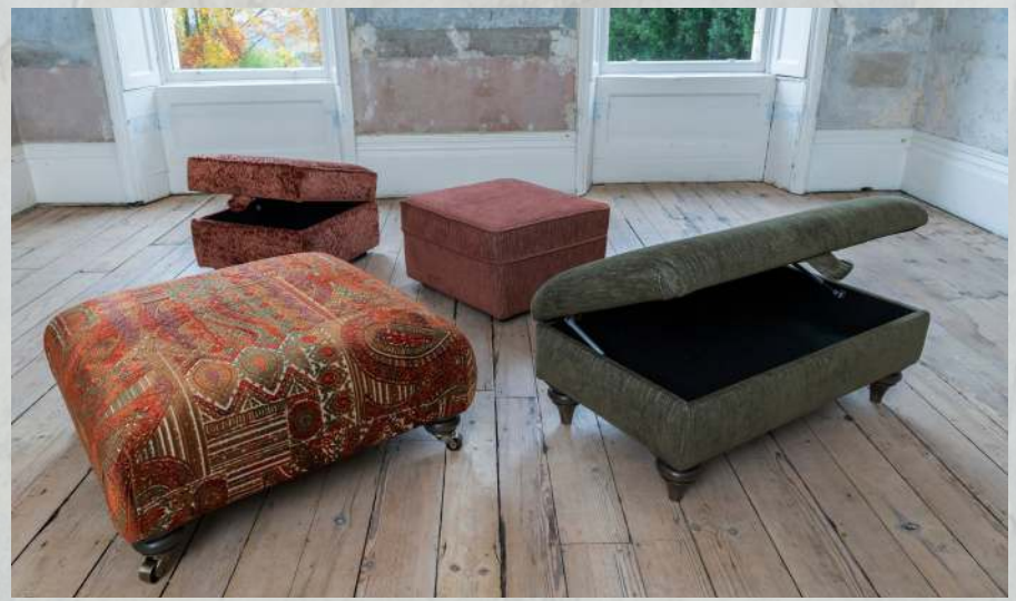
Square stool in fabric 5001, antique ash/antique brass castor legs. Storage stool in fabric 5491 (supplied on glides), Footstool in fabric 5771 (supplied on glides). Legged Ottoman in fabric 5770, antique ash solid legs.