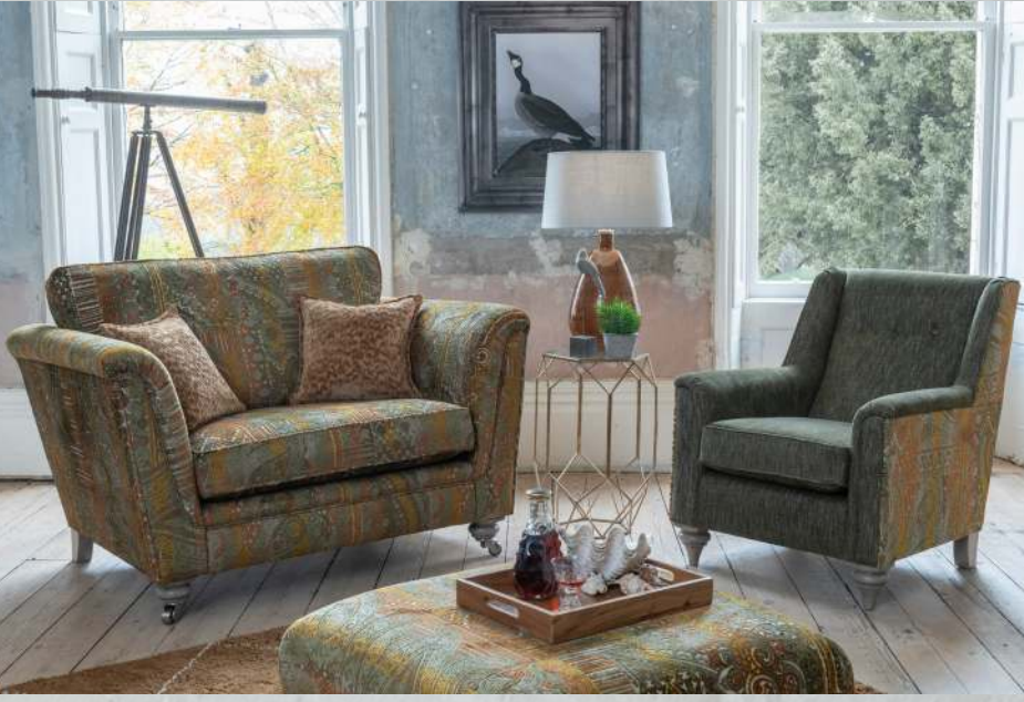
Snuggler in fabric 5000, small scatter cushions in 5493, grey ash/satin nickel castor legs. Accent chair in fabric 5770, contrasting outside arm in 5000, grey ash solid legs.