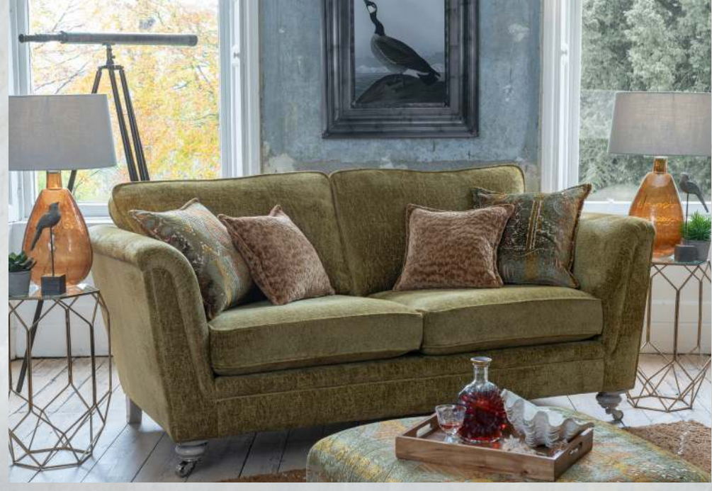
3 seater sofa (standard back) in fabric 5933, large scatter cushions in 5000, small scatter cushions in 5493, grey ash/satin nickel castor legs. Square stool in fabric 5000, grey ash/satin nickel castor legs.