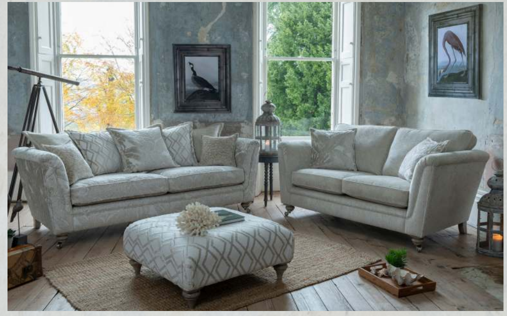
Grand sofa (pillow back) in fabric 5508, 2 pillows in 5888, 2 pillows in 5338, 1 pillow in 5508, small scatter cushions in 5498, grey ash/satin nickel castor legs. 2 seater sofa (standard back) in fabric 5888, large scatter cushions in 5508, grey ash/satin nickel castor legs. Square stool in fabric 5338, grey ash solid legs.